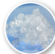
FM-8oKE-HCN Ice: Nugget